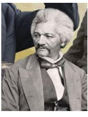
Answers on pg. 8

I refused to give up my seat on the bus. I am often