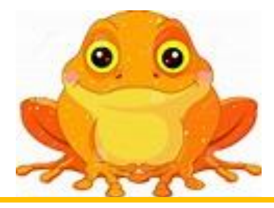
GOLDEN FROG WINNER February 2020

The interviewer looked at her, quite astonished, and asked why she had married four men with such diverse careers. She smiled and explained, "I married one for the money, two for the show, three to get ready, and four to go."