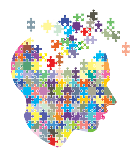
Answers on page 9.