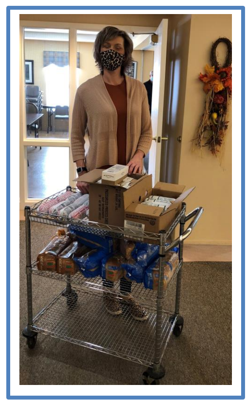
How's that for service?

Staff went into gear and moved the heavy, heavy boxes into the distribution center (community room) and storage (service coordinator's office). Then food was taken to the residents in their apartments.