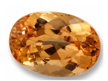
Gem = Topaz