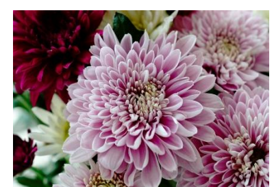
Flower = Chrysanthemum