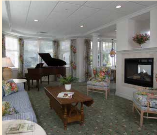
Perry Center Living Room