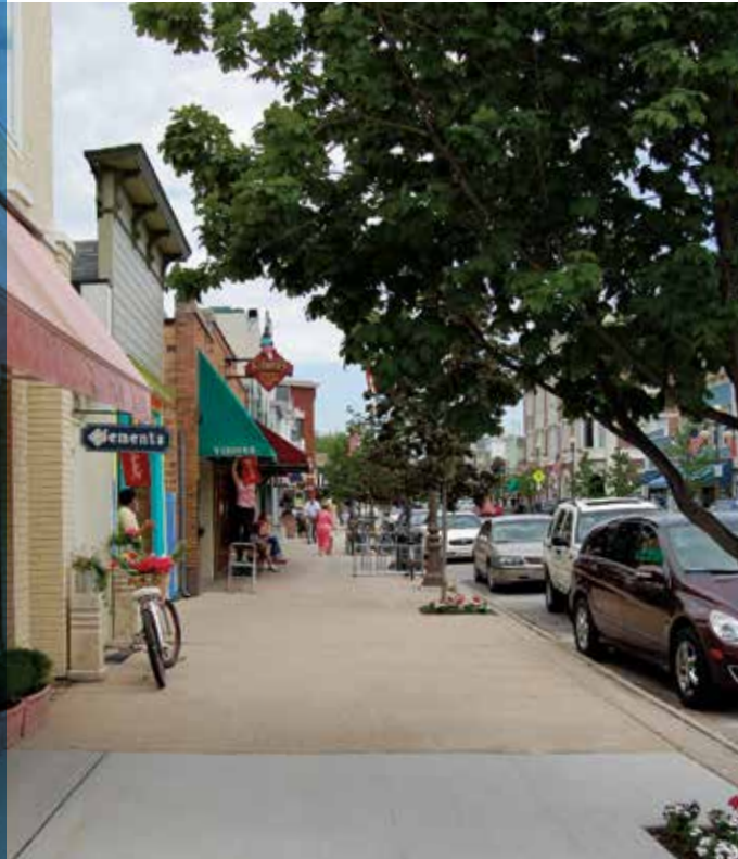
Downtown Harbor Springs

Presbyterian Villages of Michigan (PVM), provides a spectrum of residential options for seniors in 27 villages throughout the state. And PVM is more than a senior housing provider. Through programs including the Center for Senior Independence/Program for All-Inclusive Care for the Elderly (CSI/PACE), and Community Connections, PVM provides services and activities promoting independence and quality of life.