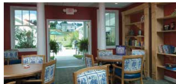
Perry Farm Village Card Room