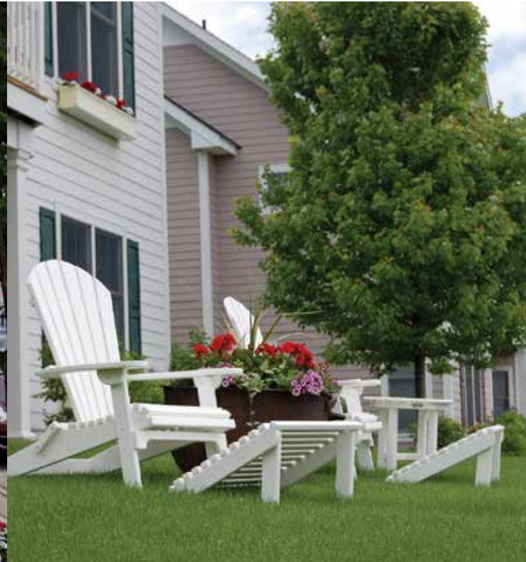
Perry Farm Village Cottages

Welcome to Perry Farm Village, one of 27 Presbyterian Villages of Michigan senior living communities. Nestled in a rolling meadow overlooking Lake Michigan — just 1/2 mile north of