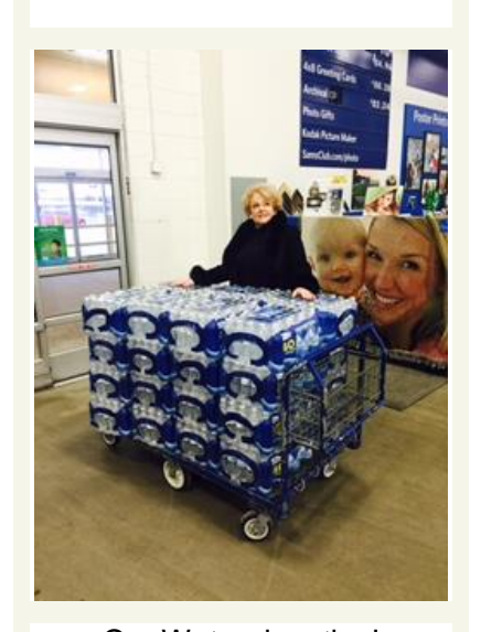
Our Water donation!

It was a great day full of fun and calories!